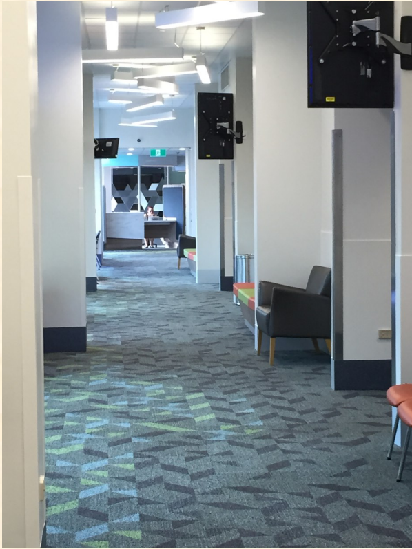
A view of the clinic area